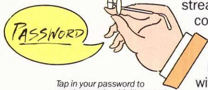
Tap in your password to reach any other Mailbox user

read. The recipient is informed of messages waiting the next time he or she begins or finishes a Prestel call. Any number of messages can be left waiting for you, and after you have looked at them you can store up to five at a time, indefinitely, and look at them as often as you like.