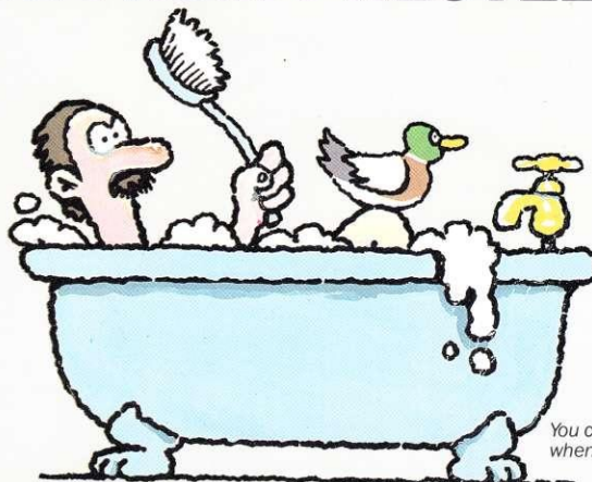
You collect messages when you are ready

Once sent, messages are stored on Prestel until