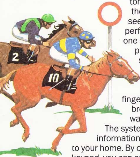
Look up tomorrow's runners or check the latest results

Prestel offers the great advantage of being a two-way system. You can send messages to Information Providers and of course one of the most obvious applications of this is electronic shopping. Several suppliers offer the ability for you to place orders by completing response frames on screen. You simply supply your credit card number and the goods will arrive on your doorstep - from such famous stores as Debenhams, or even your weekly groceries from Carrefour.